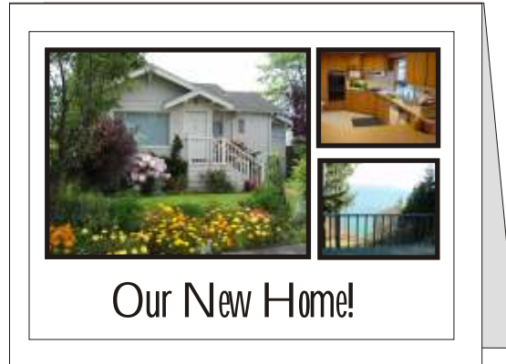
Front of card (Picture of new house) 4.25 X 5.5