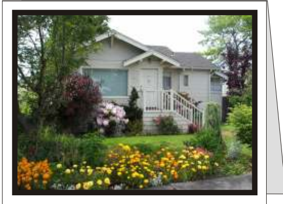
Front of card (Picture of new house) 4.25 X 5.5